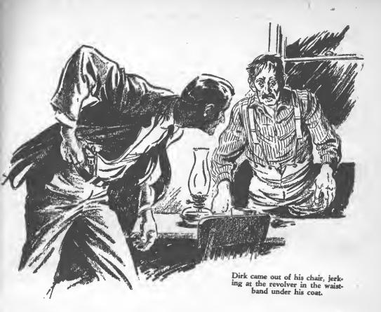
Frugal Uncle Mac's idea was never to send good money after bad, and so he swore he'd rather be dead before he lent Dirk another cent. . . . Which was exactly Dirk's idea, too!

stood listening, lest there might have been someone who heard, or saw, the shooting. When there seemed to be no one, he quickly closed the door. The shades were already frawn. At the fireplace, he worked out the ight hand corner stone of the hearth and hrust his hand into the hole.