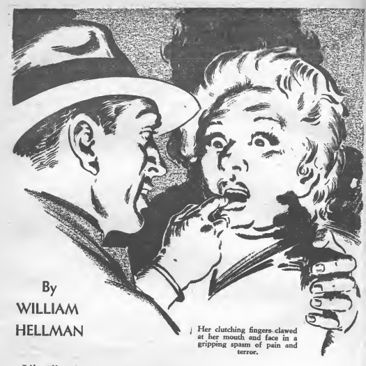
Like all artists, Rick took pride in his work, but for a brush he used a .25 automatic, and for a model, he used the woman whose unspoken words would damn him to the chair.

R ICK HAINES was a master craftsman, He admitted it. He also admitted to the cleverest brain in the profession; the police hadn't a thing on him because he always planned his ploss always worked because they were simple and direct. As now—